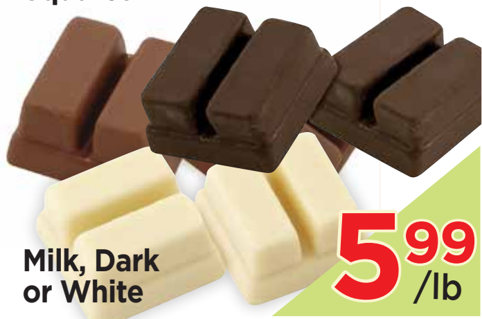
Donini Pure Baking Chocolate Squares