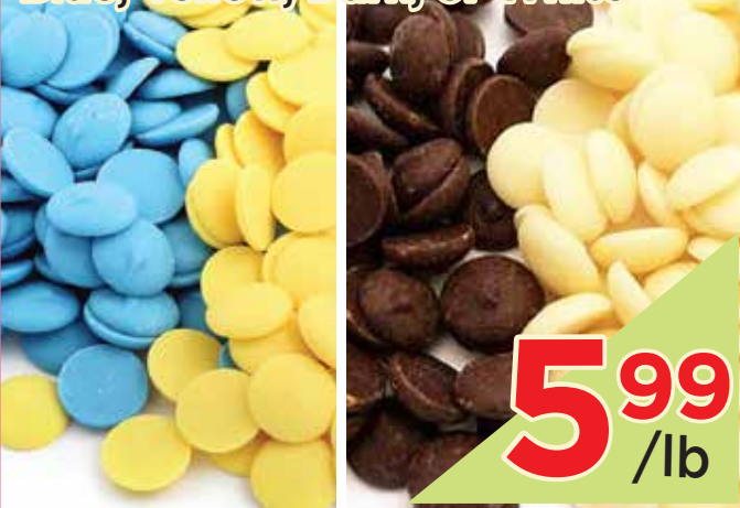
Merckens Melting Wafers Blue, Yellow, Dark, or White