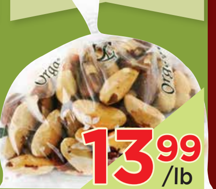
Organic Brazil Nuts