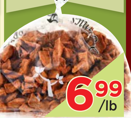
Organic Natural Diced Apples