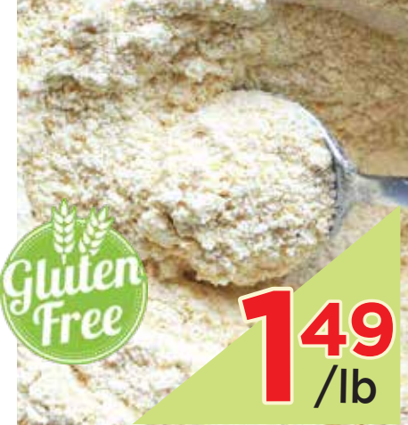
Chick Pea Flour