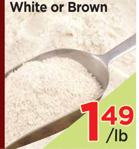
Rice Flour White or Brown