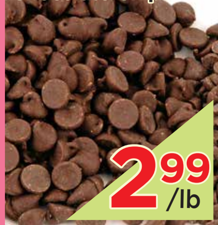
Hershey's Pure Milk Chocolate Chips