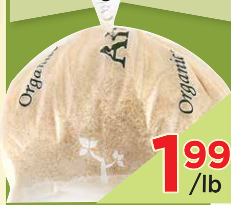
Organic Cane Sugar