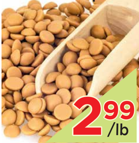
Callebaut Caramel Chocolate Chips