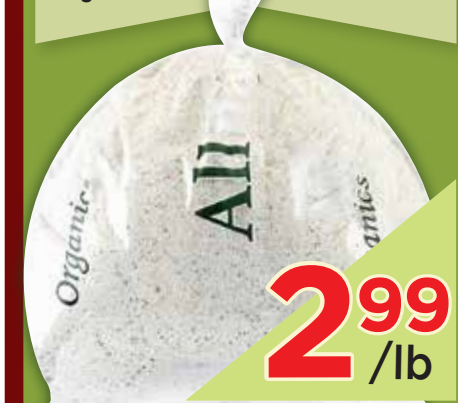
Organic Rye Flour