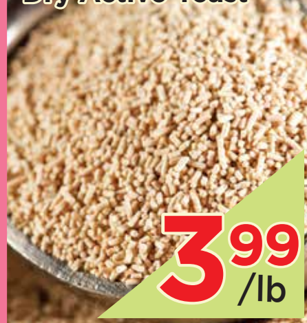
Fleischmann's Dry Active Yeast