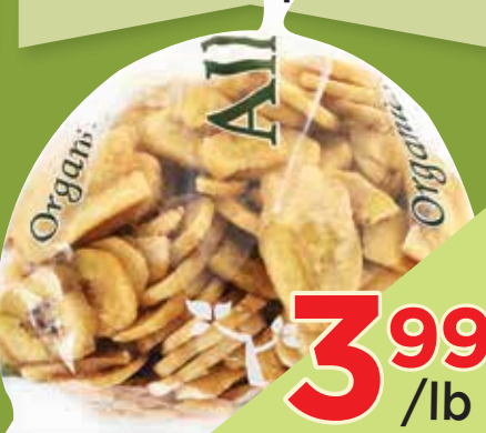
Organic Banana Chips