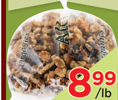
Organic Walnut Halves & Pieces