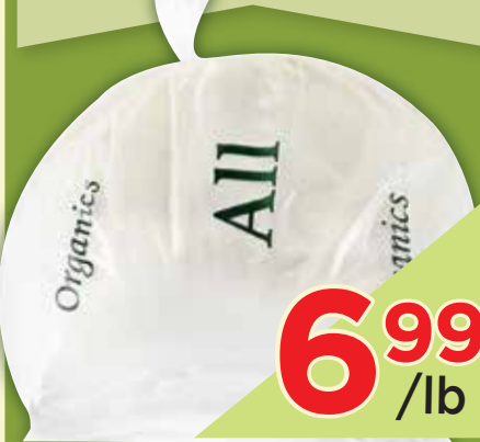
Organic Coconut Flour