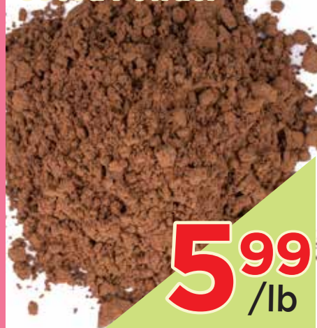
Dark Unsweetened Cocoa Powder