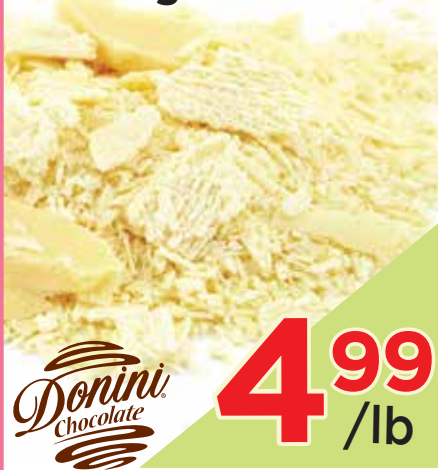
Donini White Shaving Chocolate