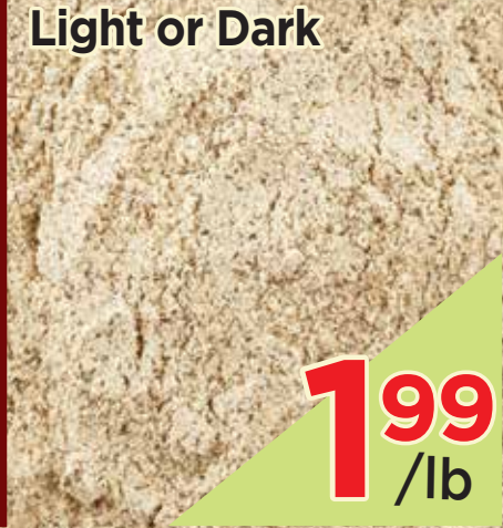
Buckwheat Flour Light or Dark