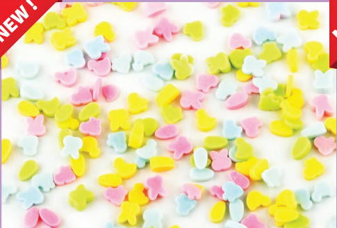
EASTER MINI BLEND DECORETTES