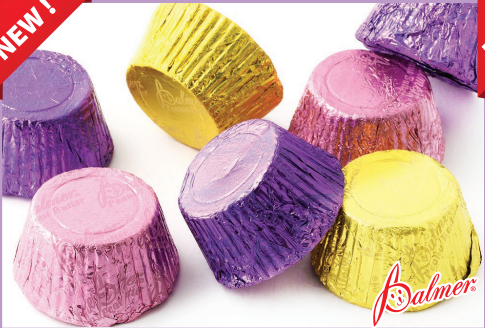
PEANUT BUTTER CUPS