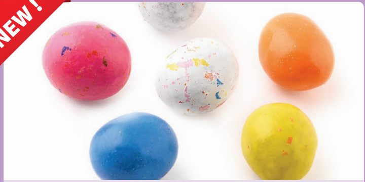
SPECKLED MALT EGGS