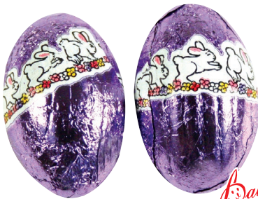
FUDGE FILLED EGG BITES