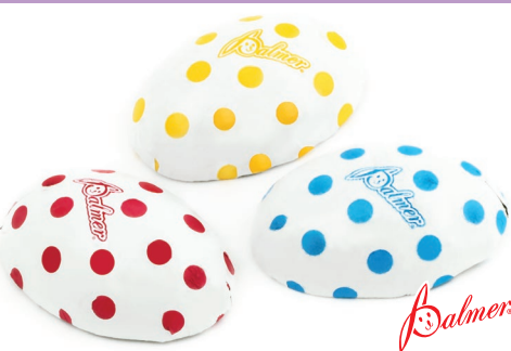
CARAMEL HALF EGGS

6793 10.88 kg 6795 10.88 kg 6815 MILK CHOCOLATE 10.88 kg