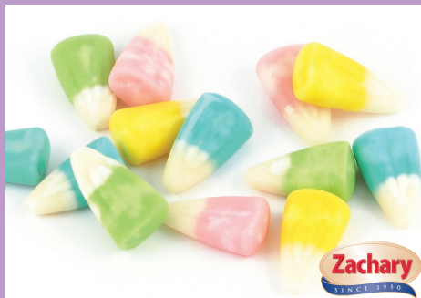
PASTEL CANDY CORN