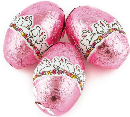
CARAMEL FILLED EGG BITES