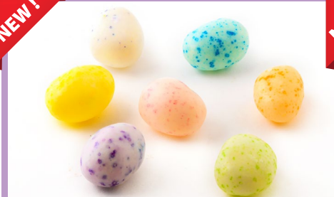
SPECKLED JELLY BEANS/EGGS