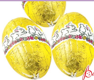
PEANUT BUTTER EGG BITES