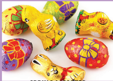
SPRING ASSORTED HOLLOW CHOCOLATES