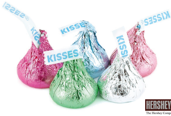
EASTER HERSHEY KISSES

ORDERS MUST BE RECEIVED BY AUGUST 16 TH , 2021