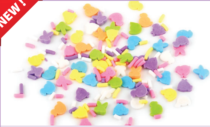
EASTER BLEND DECORETTES