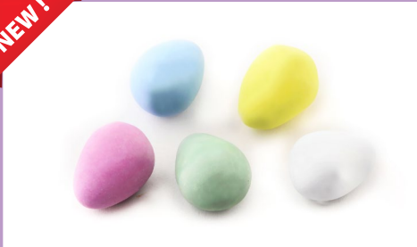
PURE MILK CHOCOLATE MINI EGGS