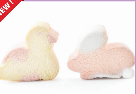
BUNNY & CHICK MARSHMALLOWS