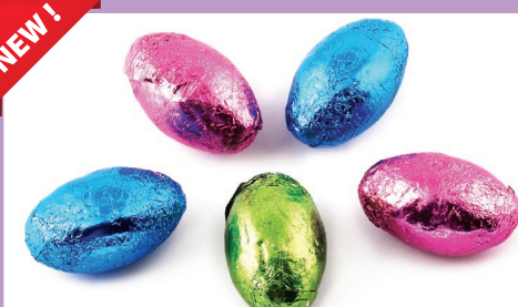
PURE MILK CHOCOLATE LILIPUT EGGS