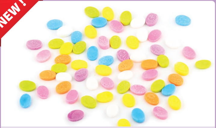
EASTER EGGS DECORETTES