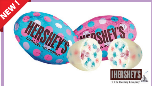
COOKIES & CREME POLKADOT EGGS