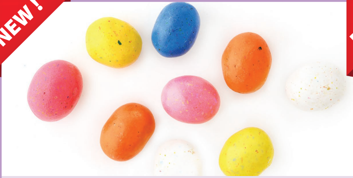
SPECKLED MALT MINI EGGS