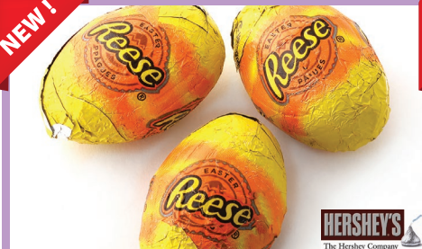
REESE'S 3D EGGS