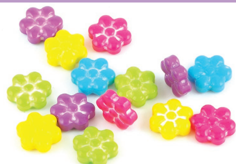
FLOWER PRESSED CANDY

6816 10.88 kg 6817 FOIL WRAPPED 5.44 kg 547 11.34 kg