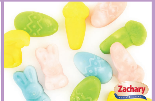
MELLO CREME MIX

3573 13.61 kg 374 13.61 kg 6748 13.61 kg